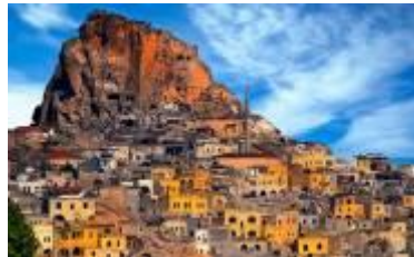
Citadel of Uchisar