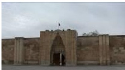
Aksaray - Sultanhan Caravanserai