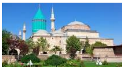
Konya - Mevlana Museum