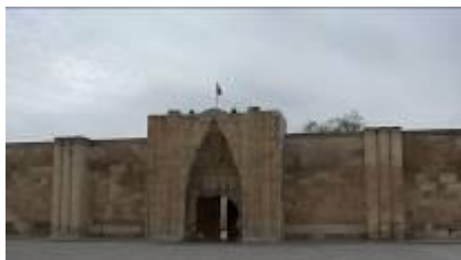
Aksaray - Sultanhan Caravanserai