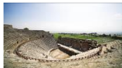
Pamukkale - Hierapolis