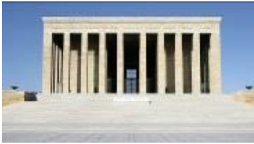
Mausoleum of Ataturk