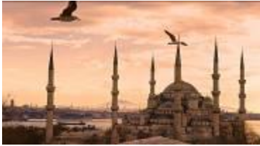
The Blue Mosque