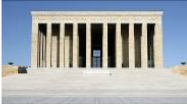
Mausoleum of Ataturk