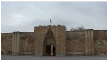
Aksaray - Sultanhan Caravanserai