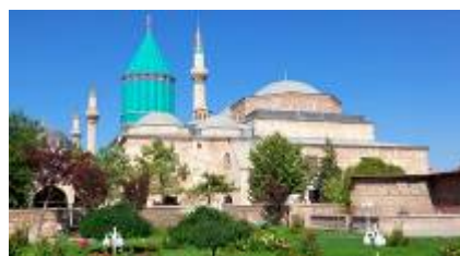
Konya - Mevlana Museum