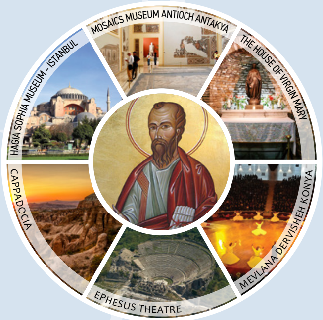
In The Foot Steps of St. Paul