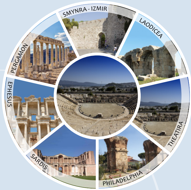
The Seven Churches of Revelation